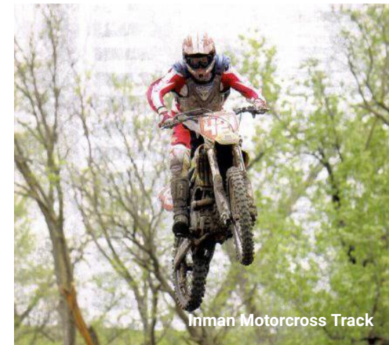
Inman Motorcross Track