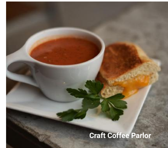
Craft Coffee Parlor