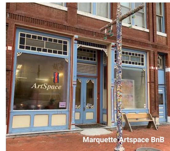
Marquette Artspace BnB