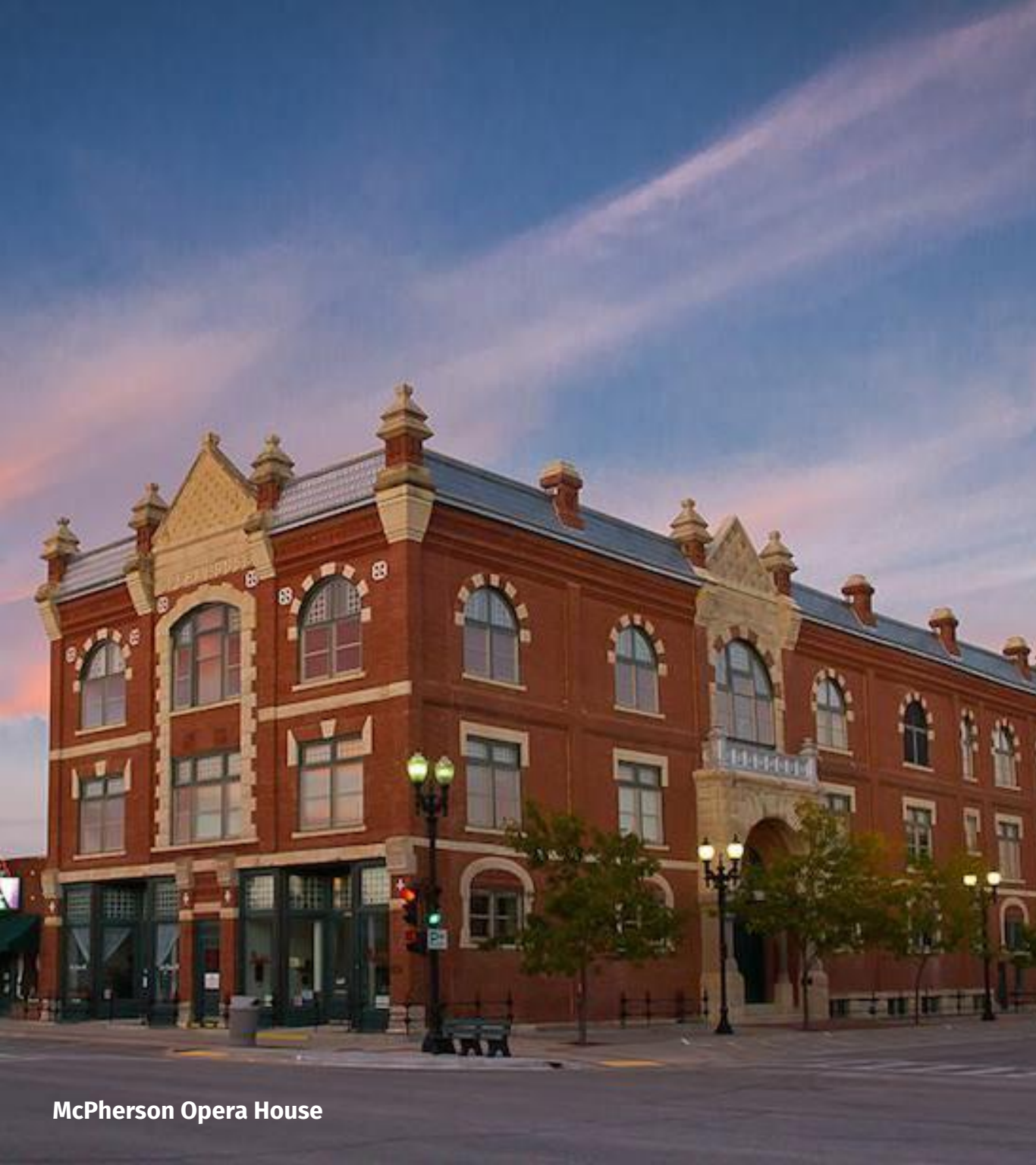
McPherson Opera House