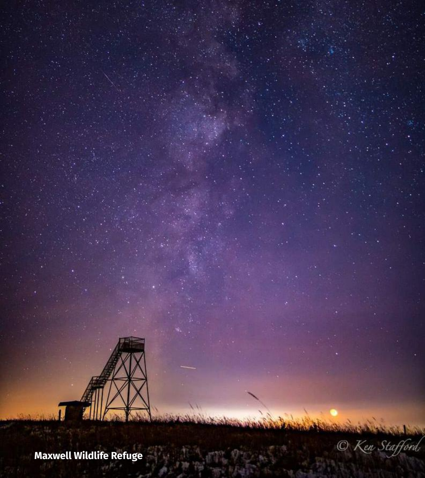
Maxwell Wildlife Refuge