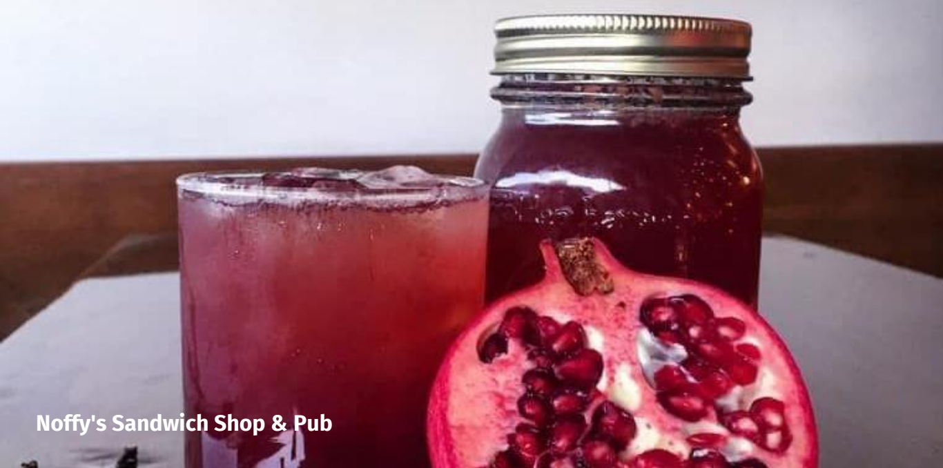
Noffy's Sandwich Shop & Pub