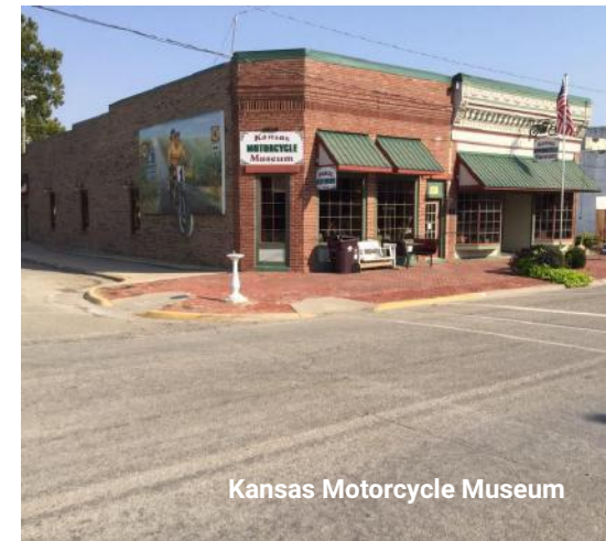
Kansas Motorcycle Museum