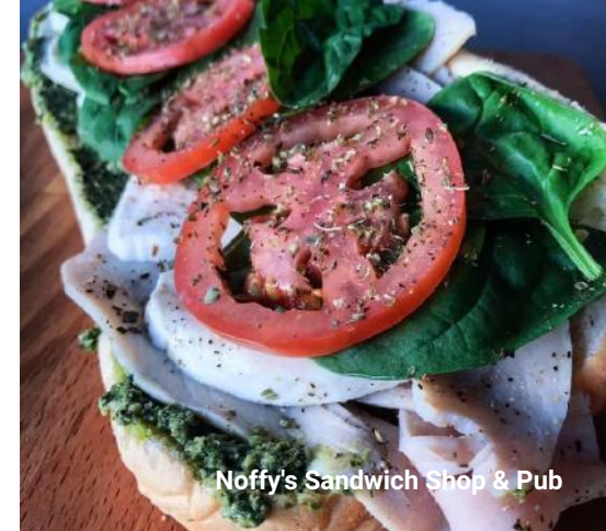
Noffy's Sandwich Shop & Pub

Kelly's Bar and Grill (Canton) Ol' Stuga (Lindsborg) Farley's Bar and Grill (Lindsborg) Smoky Valley Distillery (Marquette) Three Rings Brewery (McPherson) Noffy's Sandwich Shop & Pub (McPherson) Hank's Place (McPherson) Easy Bar and Grill (McPherson) Revolver Bar and Grill (McPherson) The Fieldhouse Sports Grill and Taps (McPherson)