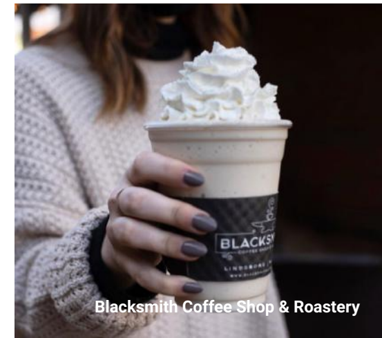
Blacksmith Coffee Shop & Roastery